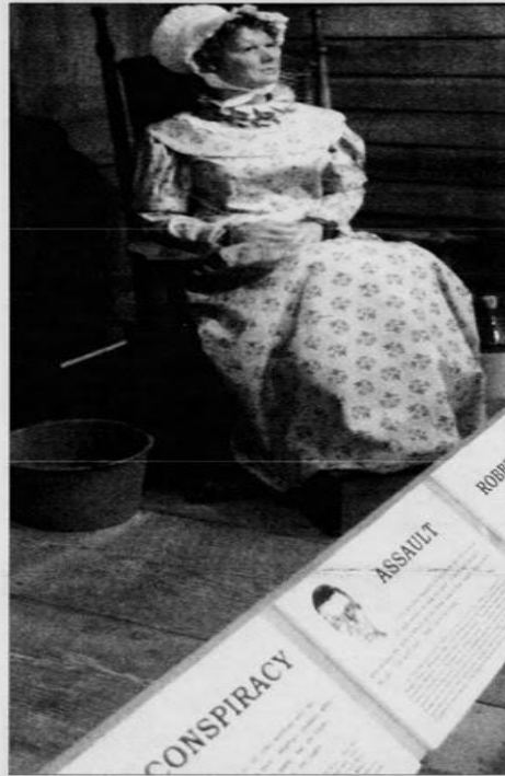
A lifelike mannequin of infamous slave trader Patty Cannon can be seen at the new Seaford Museum, along with evidence of the various charges against her.

Crossroads (Wilmington, De.), Sep. 3, 2003, Sec. K, p. 1