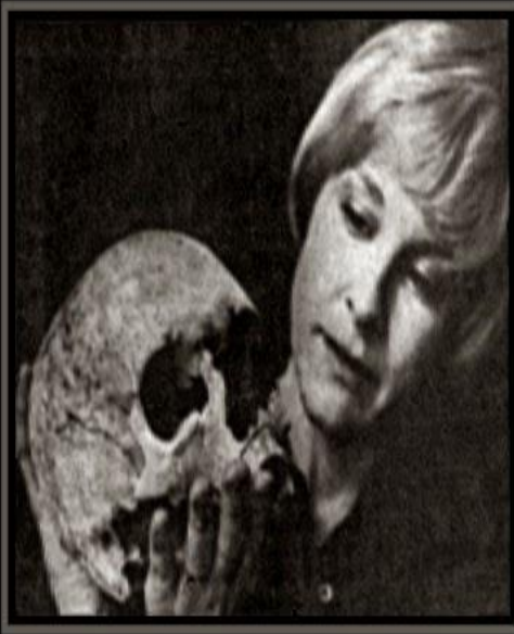
Collection of Dover Public Library, Delaware (Photo: News Journal (Wilmington Delaware), 1977, date unknown)